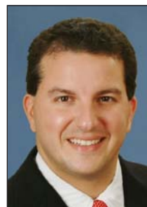
COMMISSIONER Jimmy Patronis