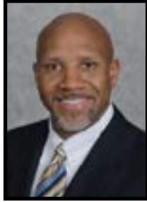
COMMISSIONER Art Graham