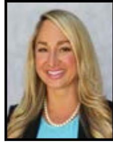
COMMISSIONER Gabriella Passidomo