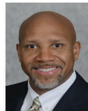
COMMISSIONER Art Graham