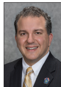
COMMISSIONER Jimmy Patronis