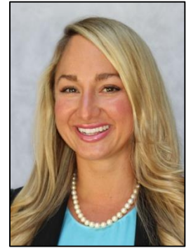
COMMISSIONER Gabriella Passidomo