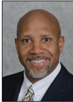
COMMISSIONER Art Graham