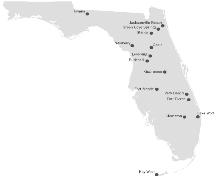
Figure 1-1 ARP Participant Cities