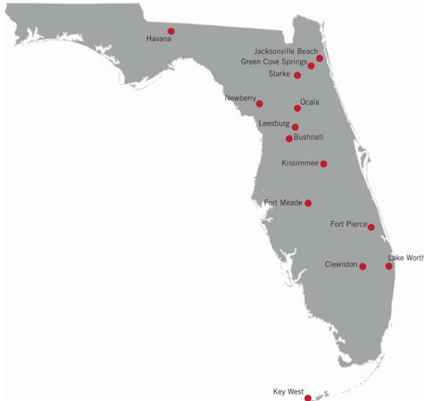
Figure 1-1 ARP Participant Cities

Following is a brief description of each of the ARP Participants who is provided capacity and energy from the ARP.