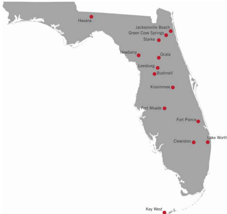
Figure 1-1 ARP Participant Cities

Following is a brief description of each of the ARP Participants who is provided capacity and energy from the ARP.